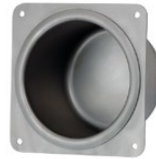
Toilet Paper Holder Front Mount