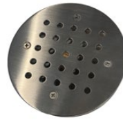
Speaking Port Level III Bullet-Resistant