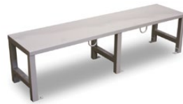
Cuff Bench Available in 4 sizes