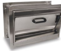
Pass Hopper Stainless Steel