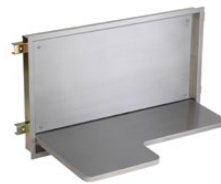
Recessed Shower Seat Stainless Steel