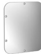
Small Wall Mirror