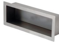
Recessed Shelf Chase Mount