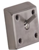
Single Hook Clothing Ball Hook