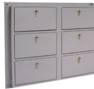
Pistol Locker Steel Cabinet