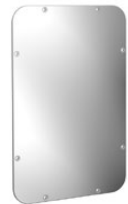
Large Wall Mirror