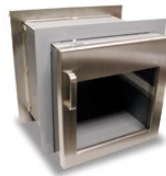
Package Pass Stainless Steel