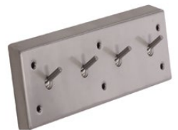
4 Hooks Clothing Ball Hooks