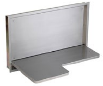
Recessed Shower Seat Stainless Steel with Straps