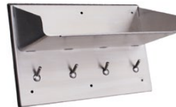
4 Hooks with Shelf Clothing Ball Hooks