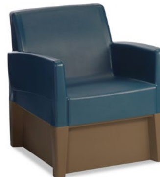
FORTÉ™ Seating Series

Infection Control Anti-Ligature Contraband Resistant Tamper Resistant Tamper Resistant Bleach Cleanable Extreme Durability