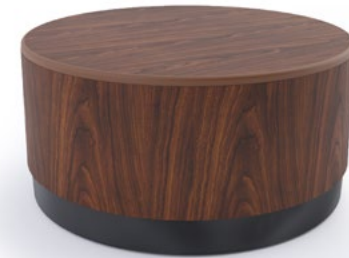
TABLA Table Collection

Anti-Ligature Contraband Resistant Tamper Resistant Bleach Cleanable Extreme Durability Ballastable