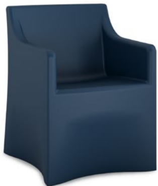
VESTA Seating Series