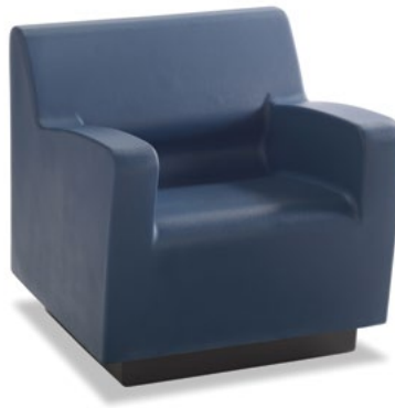
HONDO NUEVO® Seating Series

Infection Control Anti-Ligature Contraband Resistant Tamper Resistant Bleach Cleanable Extreme Durability Seamless Construction Ballastable Non-Absorbent Cleanability