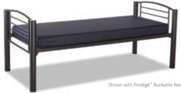
Shown with Protégé™ Bunkable Bed

1.35 pcf density convoluted foam offers plush comfort on one side while 1.5 pcf foam yields a more firm sleep surface on the other. A premium weight, polyurethane side rail surrounds the tempered high carbon steel wire innerspring unit and is protected by a spun-bonded polypropylene quilt cover. The 210 Denier Oxford Nylon mattress cover with laminated fire retardant (FR) barrier and polyurethane coating is moisture resistant, anti-bacterial, anti-fungal, crack resistant, stain resistant, anti-static and breathable. Anti-crevice inverted seam uses FR Kevlar® thread for strength and durability.