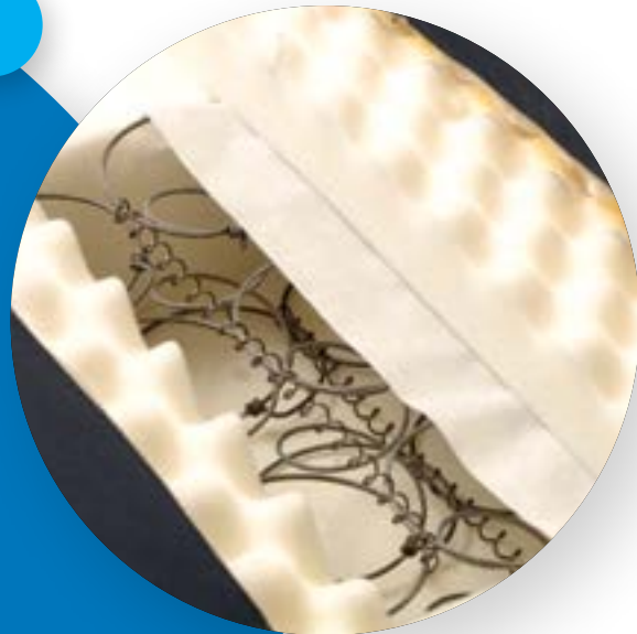
Cut away view of the Dual Comfort Foam Encased Innerspring core.