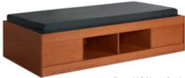
Shown with Safehouse® Captains Bed

Conventional grade foam provides balanced comfort and firmness. The 210 Denier Oxford Nylon mattress cover with laminated fire retardant barrier and polyurethane coating is moisture resistant, anti-bacterial, anti-fungal, crack resistant, stain resistant, anti-static and breathable. Anti-crevice inverted seam uses FR Kevlar® thread for strength and durability.