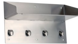
4 Hooks with Shelf Towel Hook