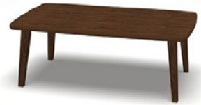
Model #HA2848 Harmony 28"X48" Rectangle Table