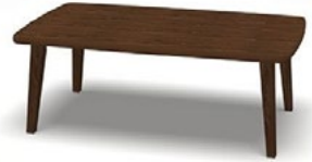
Model #HA2848 Harmony 28"X48" Rectangle Table