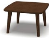
Model #HA2828 Harmony 28" Square Table

When it comes to healthcare and commercial facilities, options are paramount. Although Harmony's signature piece is its arm chair, the series also features sofas and love seats which – like the lounge chair – come with short or full aprons, and round or square backs. In addition, Harmony™ offers two and three seat benches, coffee and end tables that allow facilities to design a harmonious look in their spaces.