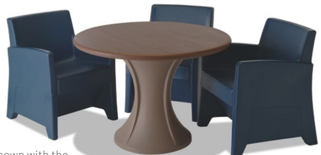
Shown with the Forté® Café table.

Our guest chairs are made of one-piece, rotationally molded polyethylene and are manufactured with ergonomic contours that provide comfortable support. These chairs are pitched slightly forward and allow for comfortable sitting at tables.