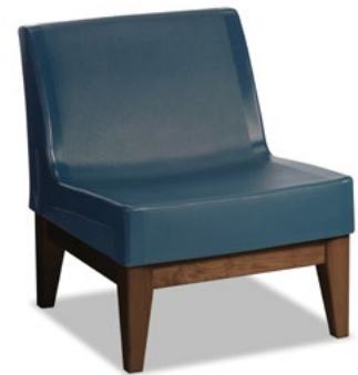
Lounge Armless Chair