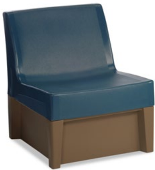
Lounge Armless Chair