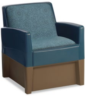
Lounge Arm Chair with Molded Plinth Base