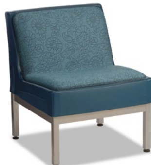
Lounge Armless Chair