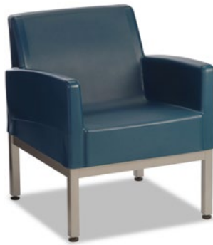
Lounge Arm Chair with Steel Base