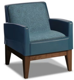
Lounge Arm Chair with Wood Legs