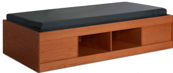
Shown with Safehouse® Captains Bed

Conventional grade foam provides balanced comfort and firmness. The 210 Denier Oxford Nylon mattress cover with laminated fire retardant barrier and polyurethane coating is moisture resistant, anti-bacterial, anti-fungal, crack resistant, stain resistant, anti-static and breathable. Anti-crevice inverted seam uses FR Kevlar® thread for strength and durability.