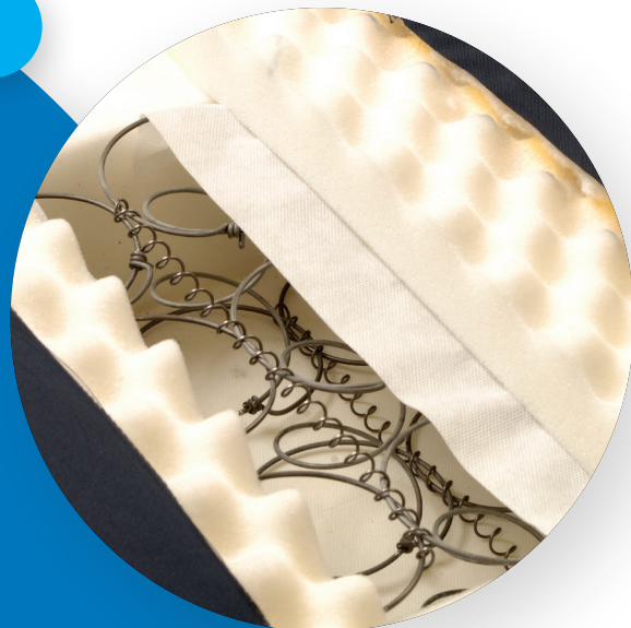
Cut away view of the Dual Comfort Foam Encased Innerspring core.