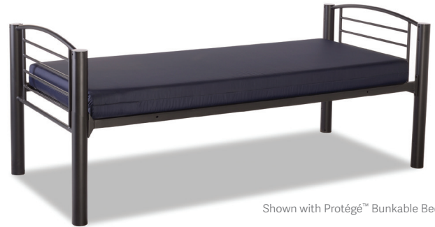
Shown with Protégé™ Bunkable Bed

1.35 pcf density convoluted foam offers plush comfort on one side while 1.5 pcf foam yields a more firm sleep surface on the other. A premium weight, polyurethane side rail surrounds the tempered high carbon steel wire innerspring unit and is protected by a spun-bonded polypropylene quilt cover. The 210 Denier Oxford Nylon mattress cover with laminated fire retardant (FR) barrier and polyurethane coating is moisture resistant, anti-bacterial, anti-fungal, crack resistant, stain resistant, anti-static and breathable. Anti-crevice inverted seam uses FR Kevlar® thread for strength and durability.