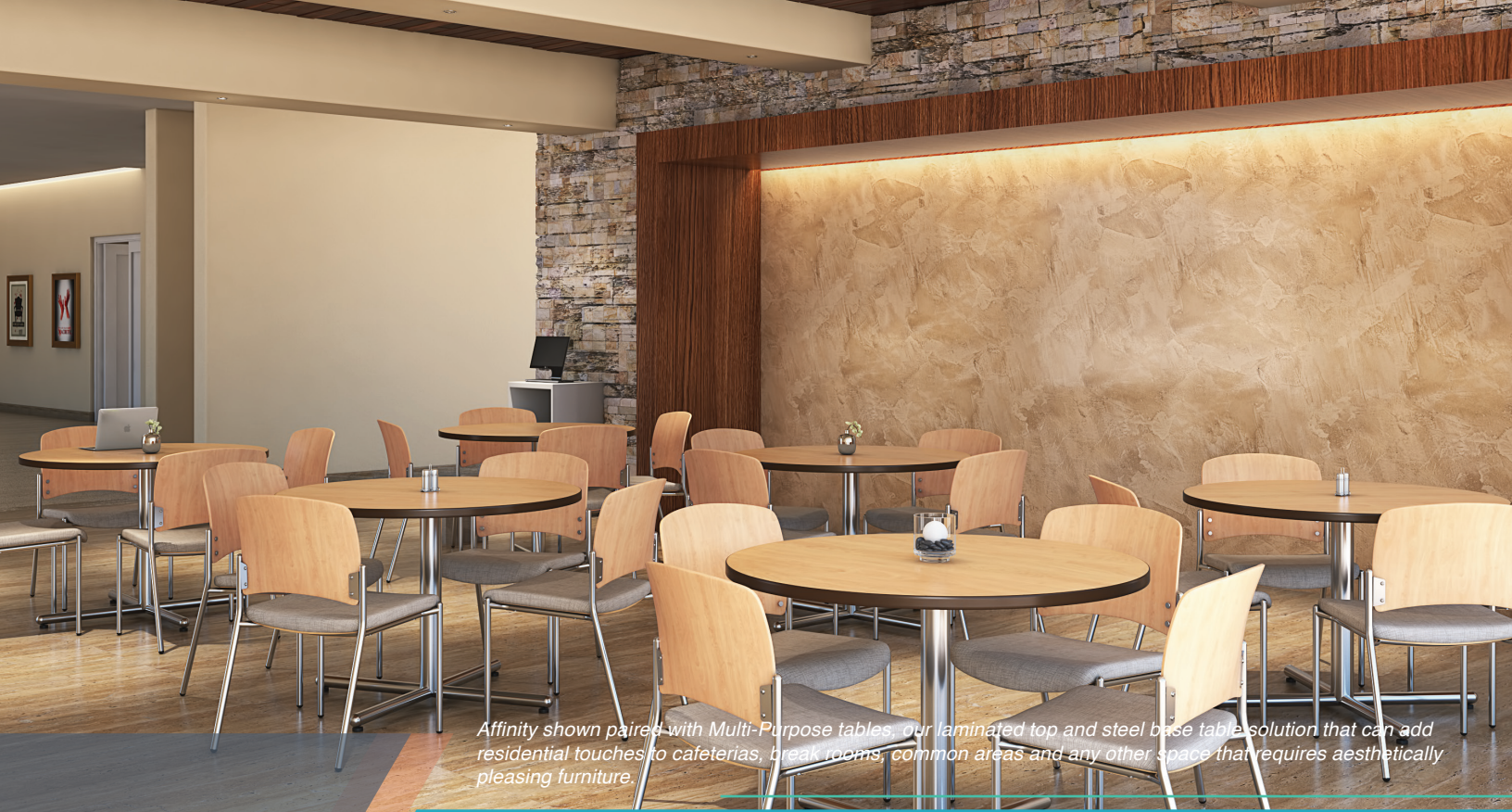
Affinity shown paired with Multi-Purpose tables, our laminated top and steel base table solution that can add residential touches to cafeterias, break rooms, common areas and any other space that requires aesthetically pleasing furniture.